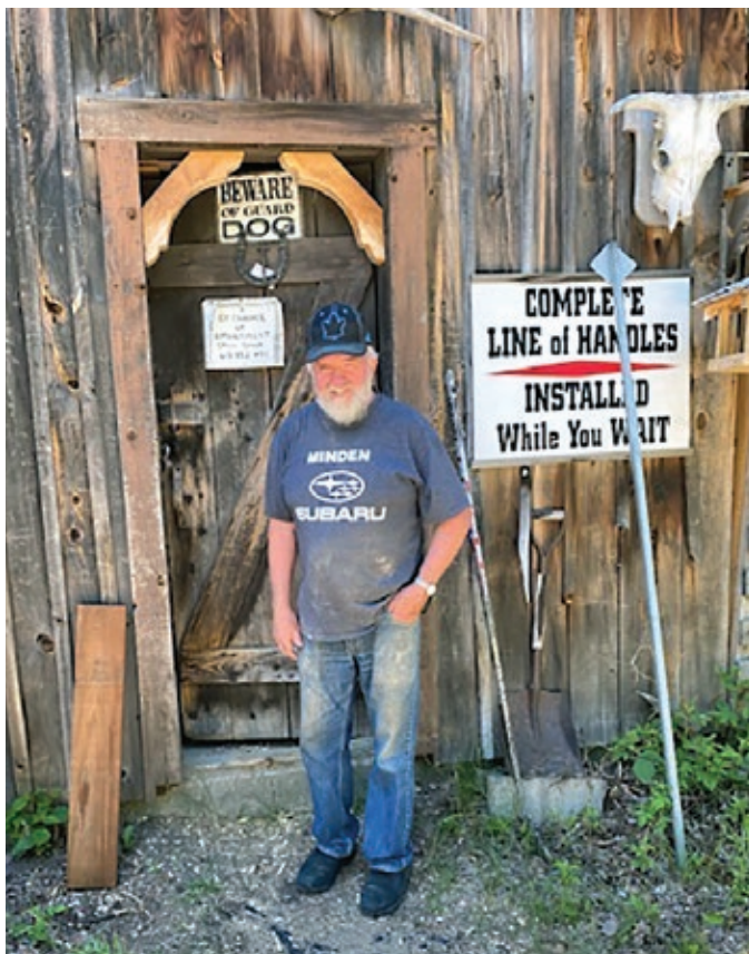
A seasoned artist, always coming up with new ideas.

A local woodworker, who has been creating beautiful charcuterie boards, paddles, screen doors and tool handles for decades, continues to provide solutions to broken garden tools, a new entrance door or wedding gifts. His workshop is an intriguing warren of stored wood, drawings and finished products. It is a must see. His business is located south of Bancroft, along Highway 28 just before Paudash School Road. Be prepared to be dazzled and inspired.