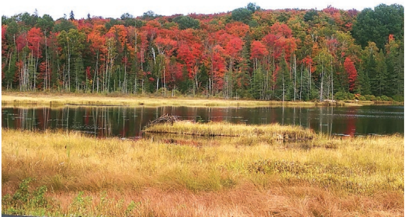
Papineau Creek.

The hope is that if the various lake associations work together with the Municipality we can accomplish much more than if we all work independently. This group and the BLA will continue to work with the Municipality to protect our lakes for future generations