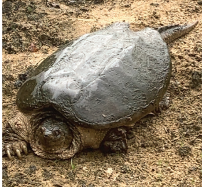
How old am I?

I wish everyone the best for your health, and for your extended lake families and friends. I encourage you to continue to support our rural communities and to make the most of our changing world, and the waterfronts that sustain us.