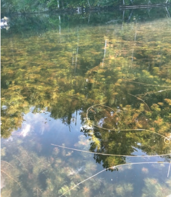
This is why we need water testing.