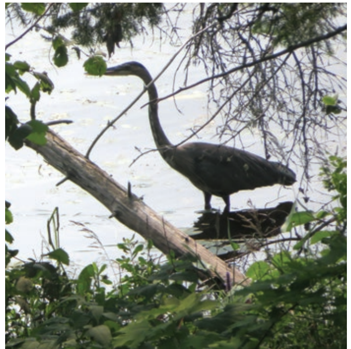
Fishing in the cove.