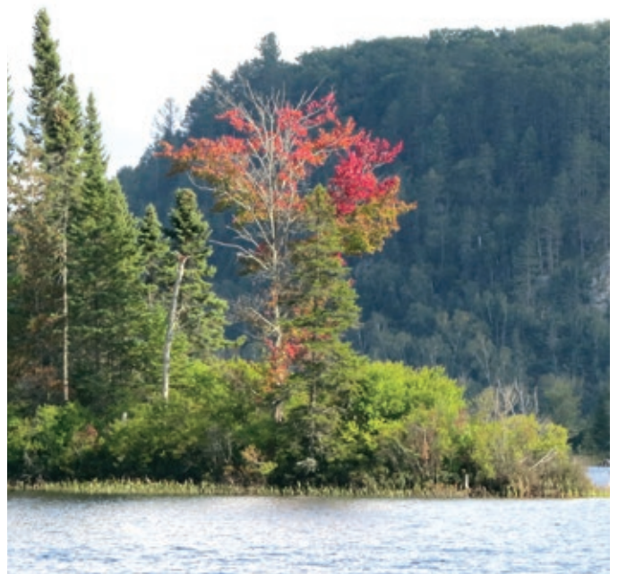
Maple contrast.

The BLA continues to be part of the Hastings Highlands Interlake Group. Elsewhere in the Newsletter there is an article regarding the Interlake Group. We