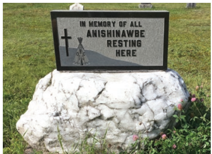
This is in honour of the children who died while in attendance at the residential schools. Remember Baptiste Lake was named after the Baptiste family.

You can read more at www.hastingshighlands.ca