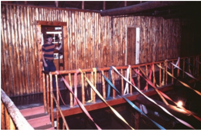
Always something to celebrate.