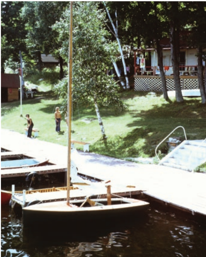
Sailboat safely docked.