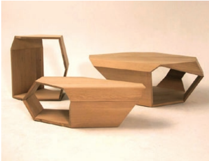
Coffee table and side tables by Kyle.