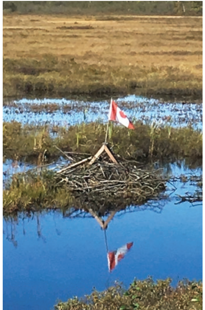
Find the all canadian beaver on Highway 127.