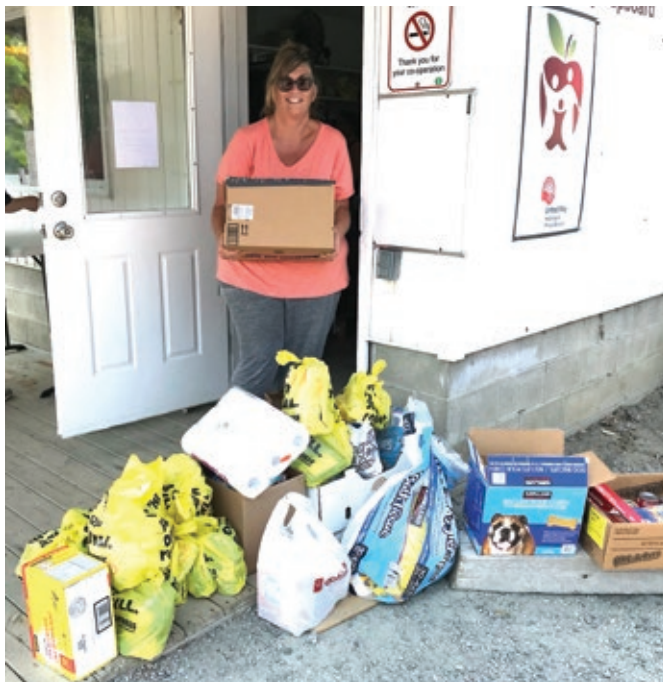
Volunteer accepting donations.

The effort was greatly appreciated by the Food Bank and we intend to make next year's BLA drive even better.